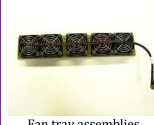
Fan tray assemblies