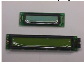
Mounting of displays on PCBA