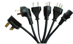
Molded connectors for individual countries