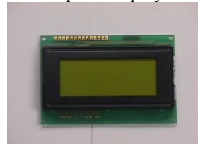
Various other display terminations.