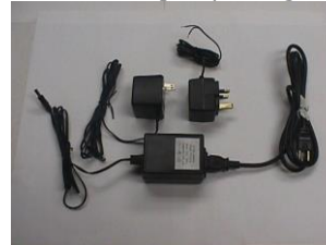
Wall and desktop chargers