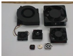
Fans and blowers.