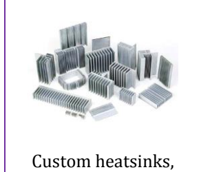
Custom heatsinks, extrusion/profiles