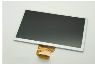
Termination with flex cable/circuit.